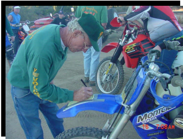
Volunteers conduct sound tests to keep vehicles in code

Please help save the San Bernardino National Forest Association's Off-Highway Vehicle Volunteer Patrol Program!